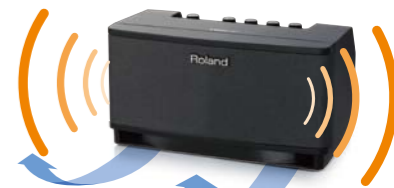
2.1-channel sound system with subwoofer

The CUBE Lite series is based on a 2.1-channel speaker design with subwoofer, which lets you experience music with impressive, full-range sound. Compact and streamlined, CUBE Lite can be easily positioned and enjoyed in any environment.