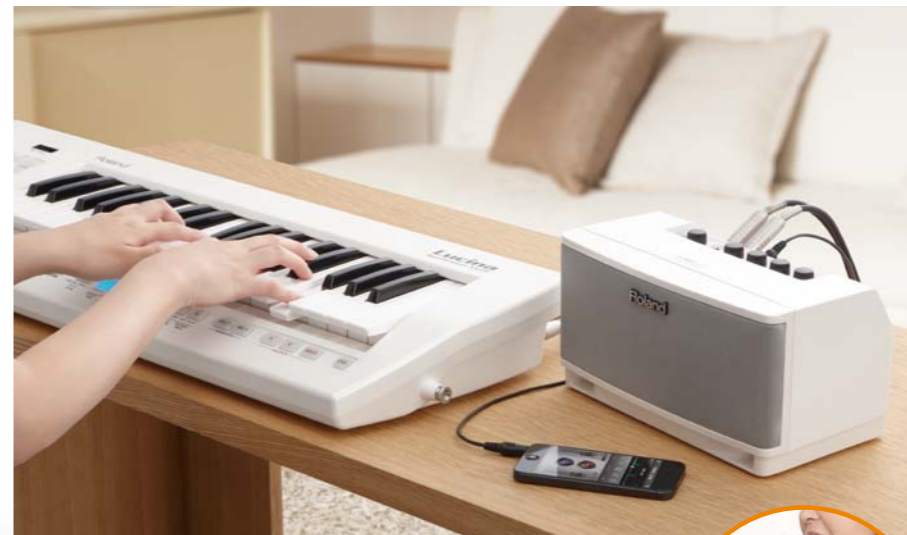
Chorus and Reverb