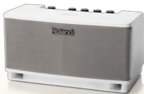
CUBE Lite MONITOR